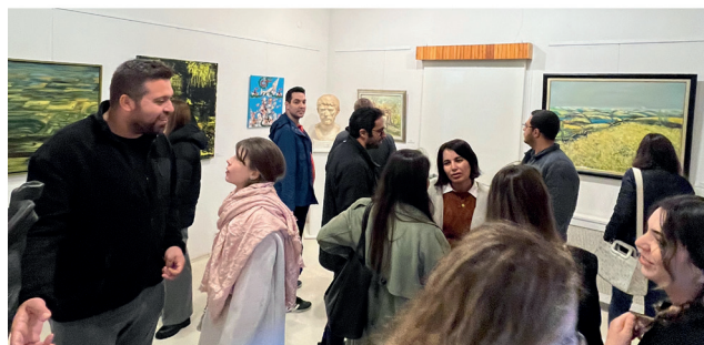
Photograph 2. Trakya University Fine Arts Campus

Ottoman health facility built in the 15th century. This complex, which served as a center for health services and medical research, includes a hospital, madrasah, library, bathhouse, and dârüşşifa. It offered advanced health services for its time and was a pioneer in modern medical care and education. [3]