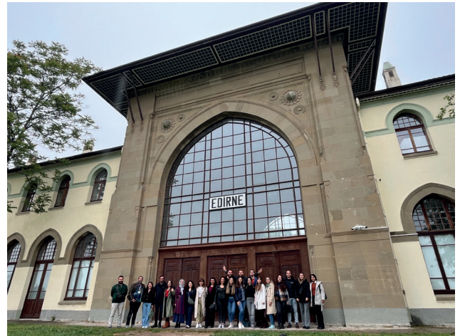
Photograph 4. Historical Train Station