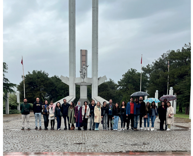
Photograph 3. Lausanne Monument

Ottoman health facility built in the 15th century. This complex, which served as a center for health services and medical research, includes a hospital, madrasah, library, bathhouse, and dârüşşifa. It offered advanced health services for its time and was a pioneer in modern medical care and education. [3]