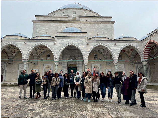
Photograph 6. 2nd Sultan Bayezid Health Complex

The complex is notable for its architecture and functioned as a modern health center. The museum, now owned by Trakya University, showcases the original Ottoman dârûşşifa, where treatment methods involved music and water sounds, reflecting the medical knowledge of that era. The madrasa trained physicians and was a key medical school of its time. [3] This visit allowed participants to explore the historical and architectural richness of this 400-year-old center, providing valuable insights into medical education and health services for the Family Medicine residents involved in the exchange (Photograph 6).