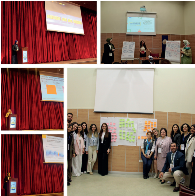
Photograph 11. EYFDM Türkiye Coordinators Speeches and Workshops of EUROPREV Forum

This was followed by the EUROPREV Forum oral presentation session, where qualitative and quantitative research from the perspective of preventive health services was presented on a variety of topics ranging from obesity management in primary care to tobacco control, from preventive strategies for non-communicable diseases to mammography screening refusal. [5]