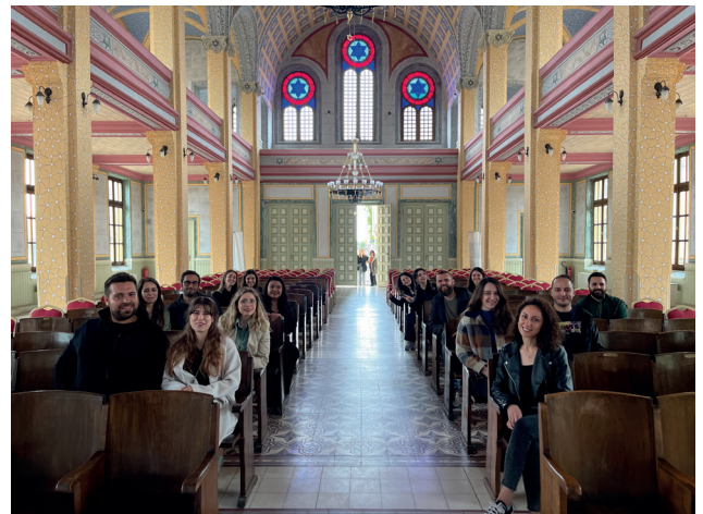
Photograph 5. Great Synagogue