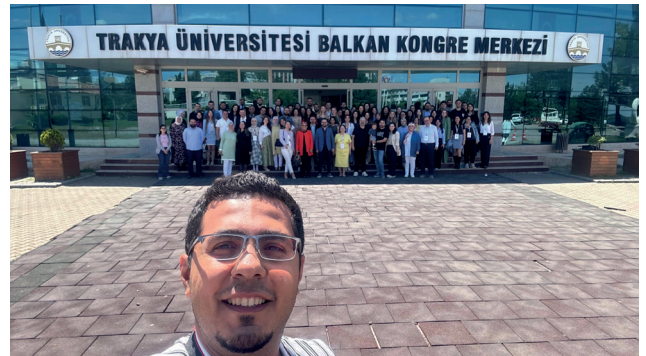
Photograph 16. Trakya University Family Medicine Department on The Last Day of 13. TAHEK Congress

At the end of a full week, on the last day of saying goodbye to our colleagues who completed the exchange program, as the EYFDM Türkiye team, we received feedback and suggestions from each of them about their experience. As a common conclusion of us, the hosts and the colleagues we hosted, we have observed how valuable the EYFDM movement is for us young family doctors. With these new connections we established professionally and individually, we completed our program by agreeing to meet again in congresses and exchange programs with the desire to share this experience, which opened new doors for us in the future of family medicine, with all our colleagues (Photograph 16).