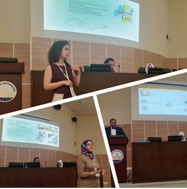
Photograph 13. TAHEK's EYFDM Türkiye Session