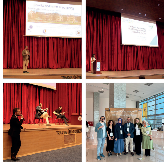
Photograph 10. First Day of EUROPREV Forum