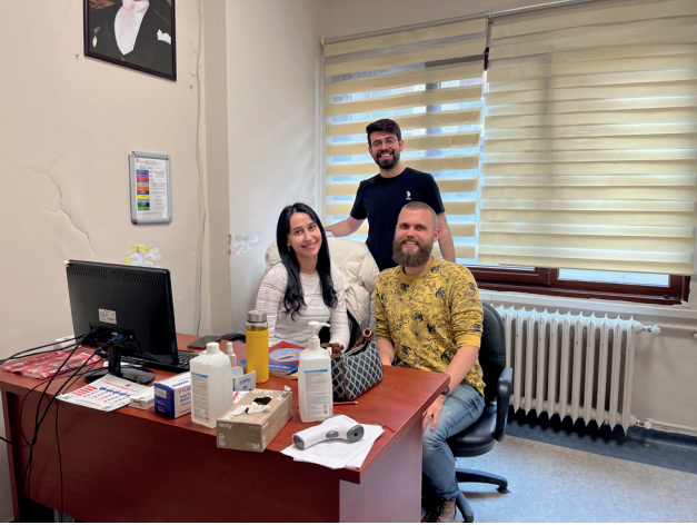
Photograph 1. Trakya University Family Medicine Department Polyclinic