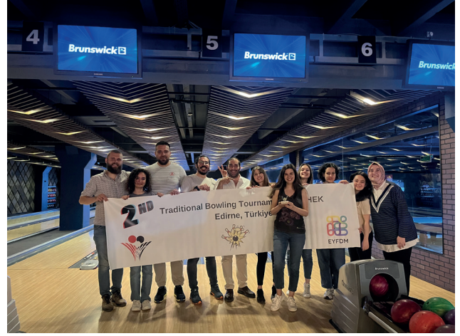
Photograph 15. 2nd Traditional Bowling Tournament of TAHEK

The most emotional moment of the program came on departure day, as participants were reluctant to