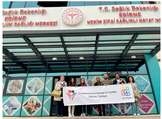
Photograph 8. Edirne Hekim Şifai Healthy Life Center Visit

Our program continued at Edirne Hekim Şifai Healthy Life Centre (Photograph 8). The physicians and other health professionals working there gave information about cancer early detection, screening and education, tuberculosis control services, nutrition counseling, chronic diseases and physical activity counseling, tobacco and substance abuse counseling, dental health, women and reproductive health counseling and explained the functioning of each unit. Then they answered the questions of our colleagues participating in the exchange program. In this part of our program, the participants had the opportunity to learn about preventive health services in primary health care in Türkiye and to observe the cooperation between different disciplines.