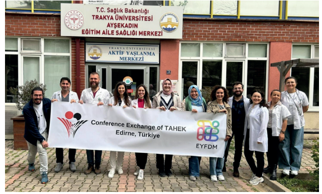
Photograph 7. Trakya University Ayşekadın Education Family Health Centre

On the third day of the EYFDM Conference Exchange program, our colleagues from various European countries visited Trakya University Ayşekadın Education Family Health Center (Photograph 7). They observed Türkiye's primary health care services and patient interviews. Resident doctors introduced vaccination, child follow-up, pregnancy care, reproductive health, and medical intervention rooms. We discussed the Trakya University Active Ageing Centre, which promotes healthy aging and social participation for the elderly. The EYFDM Türkiye team then presented on Türkiye's primary health care system, chronic disease management, and the appointment and prescription